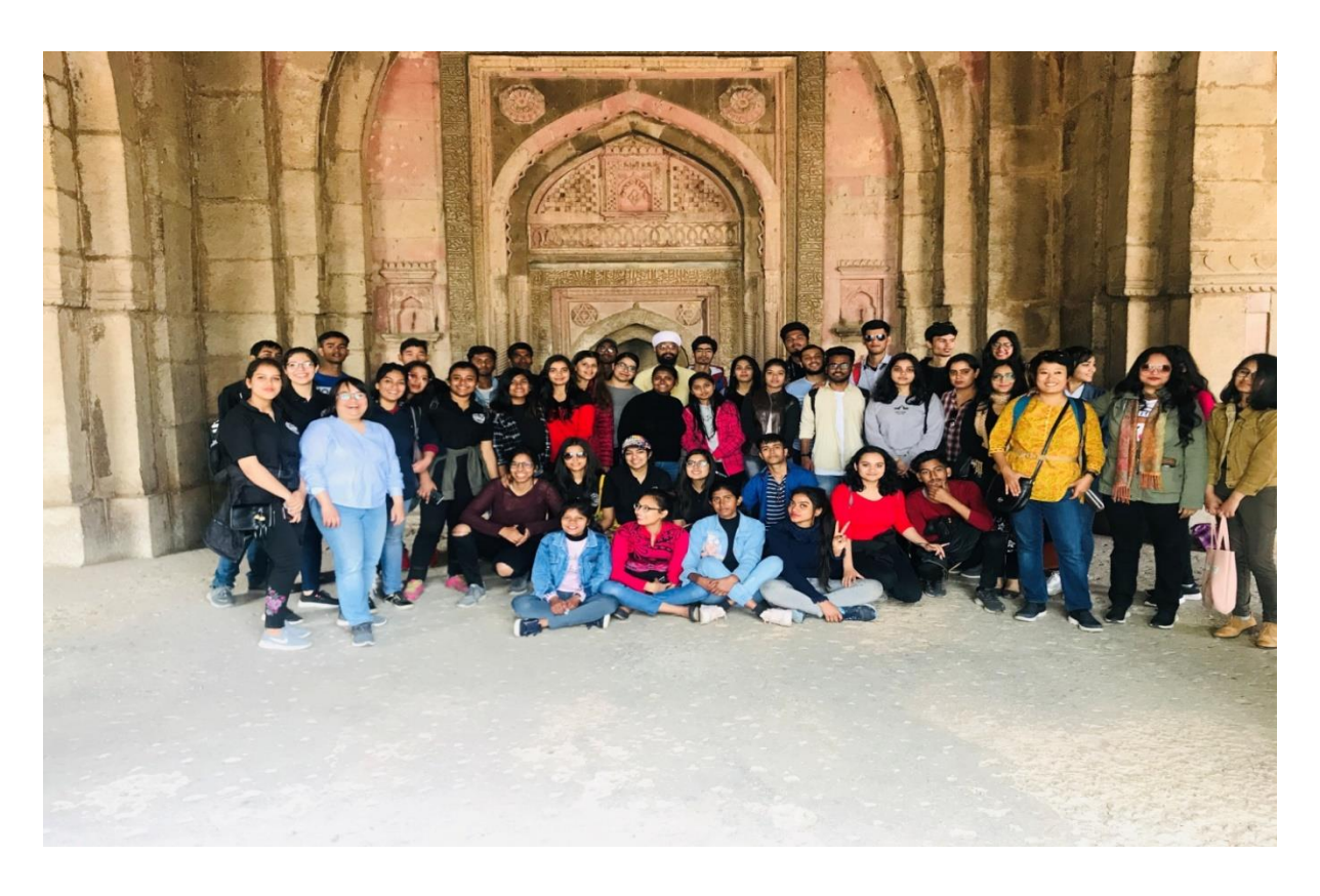
At Jamali Kamali Mosque and Tomb